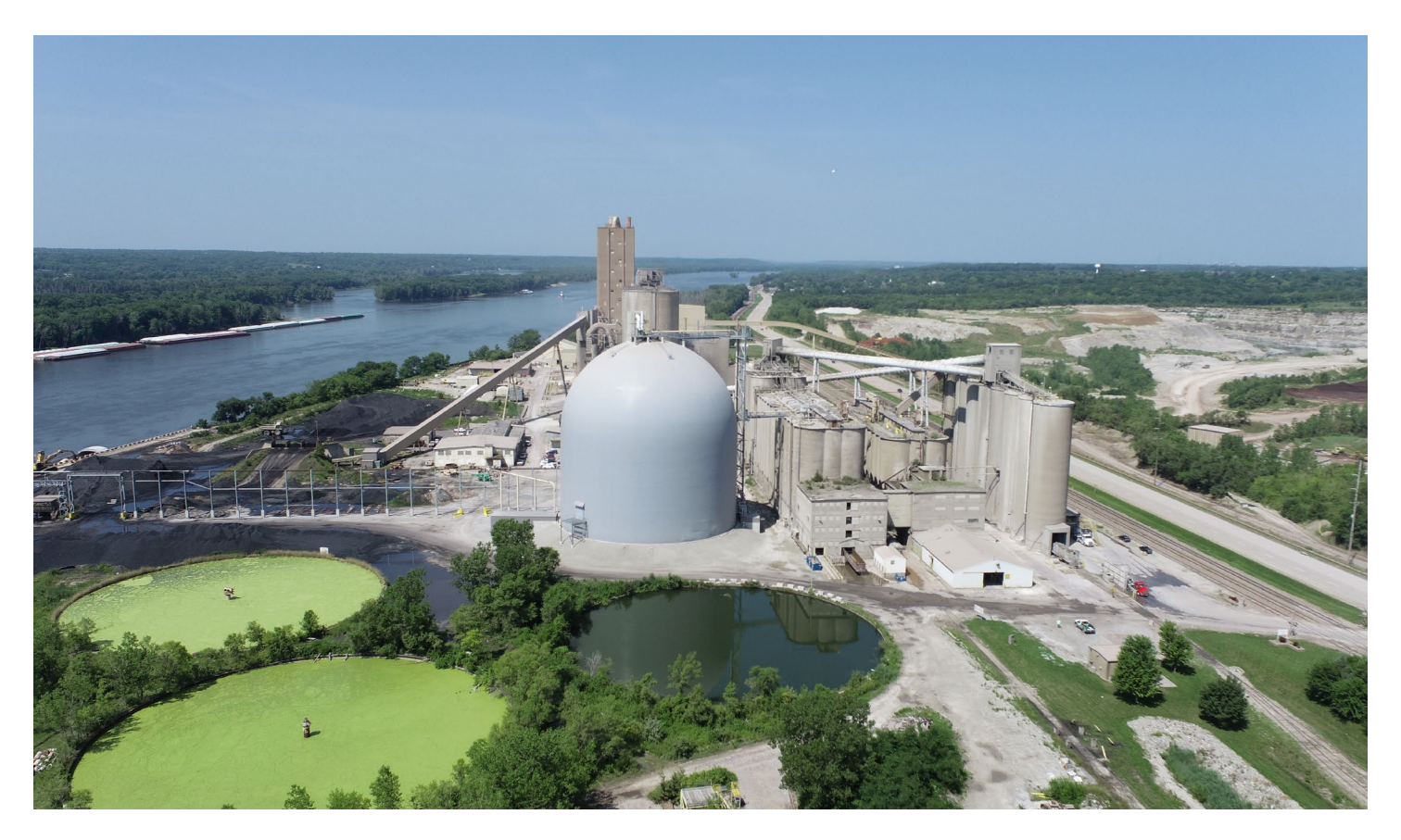
Continental Cement Company's new DomeSilo in Davenport, Iowa, can store 125,000 short tons of cement powder. Cement is reclaimed at 350 stph and pneumatically conveyed to barges on the Mississippi River.